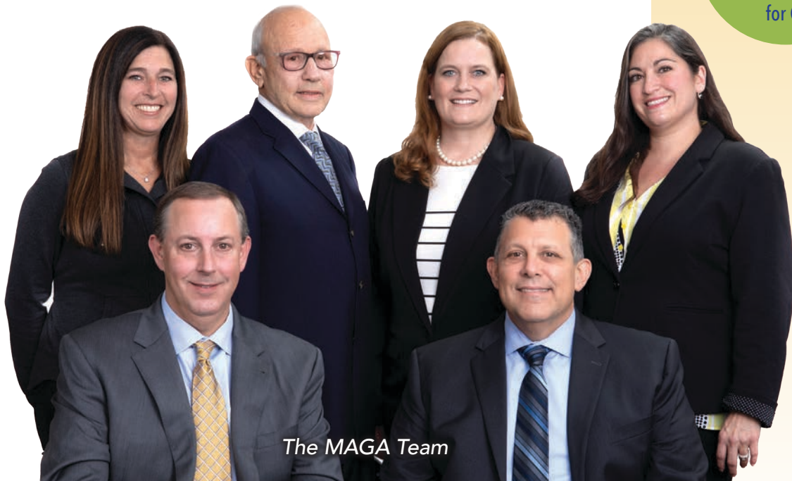
The MAGA Team